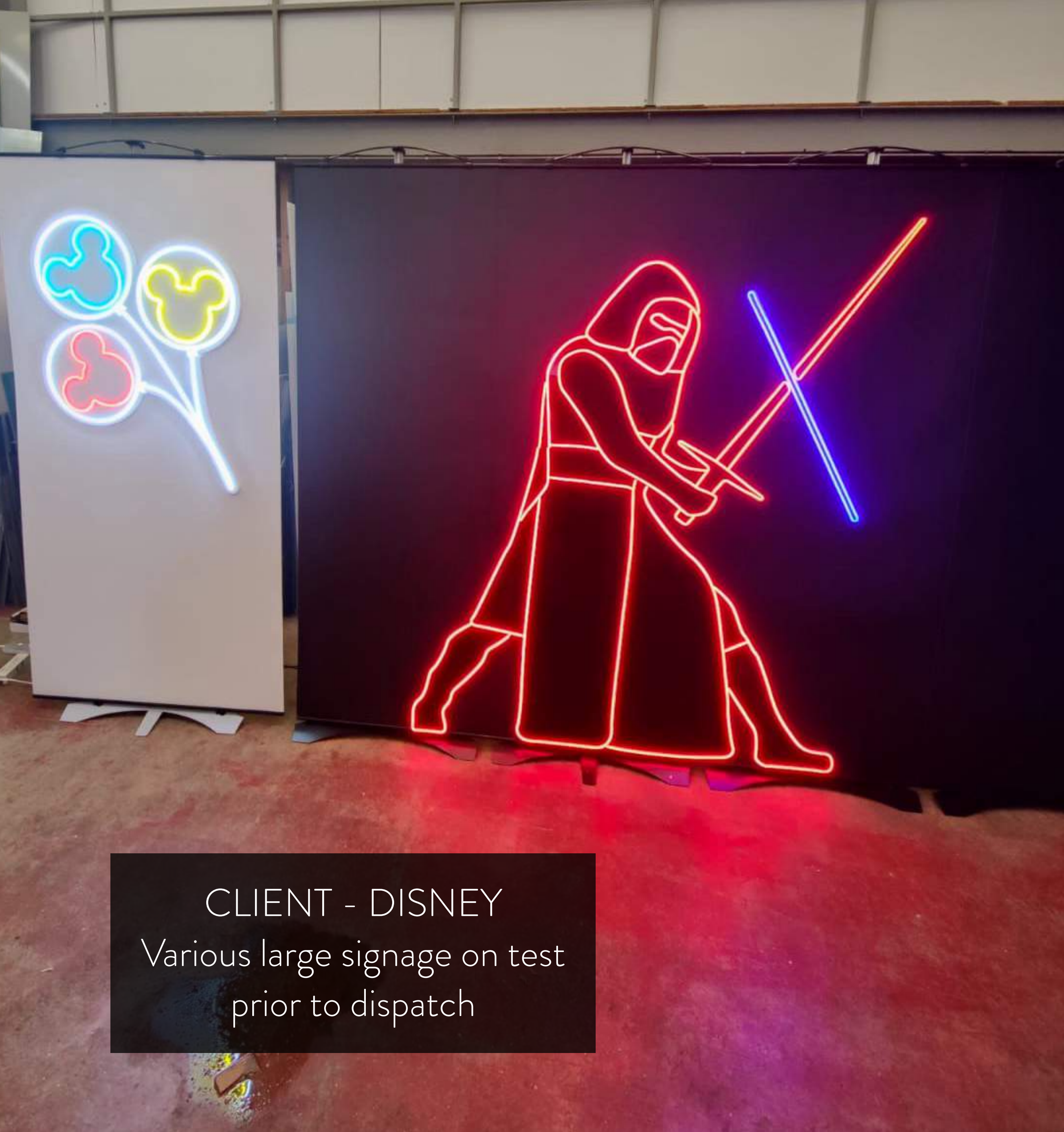
CLIENT - DISNEY Various large signage on test prior to dispatch