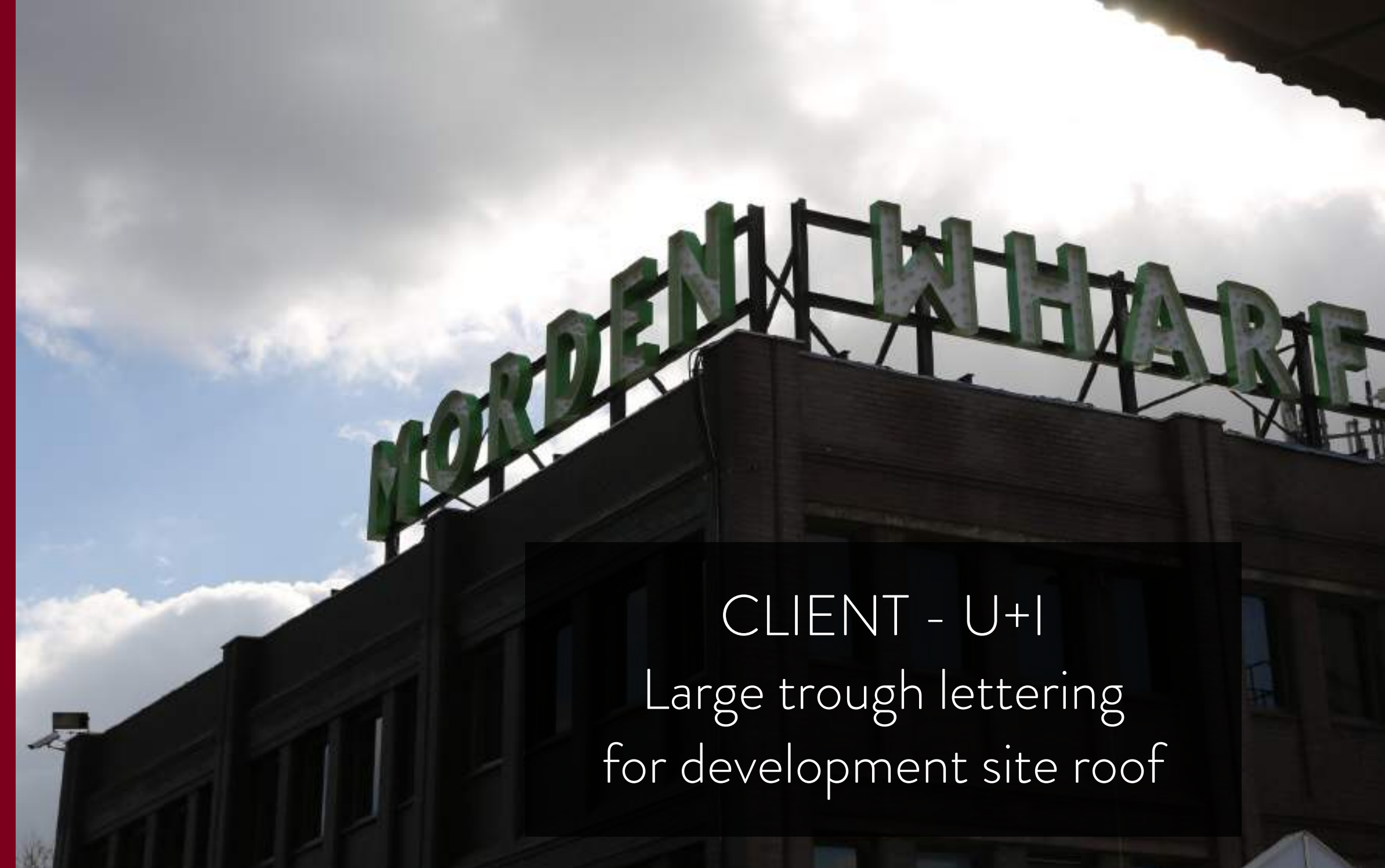
CLIENT - U+I Large trough lettering for development site roof