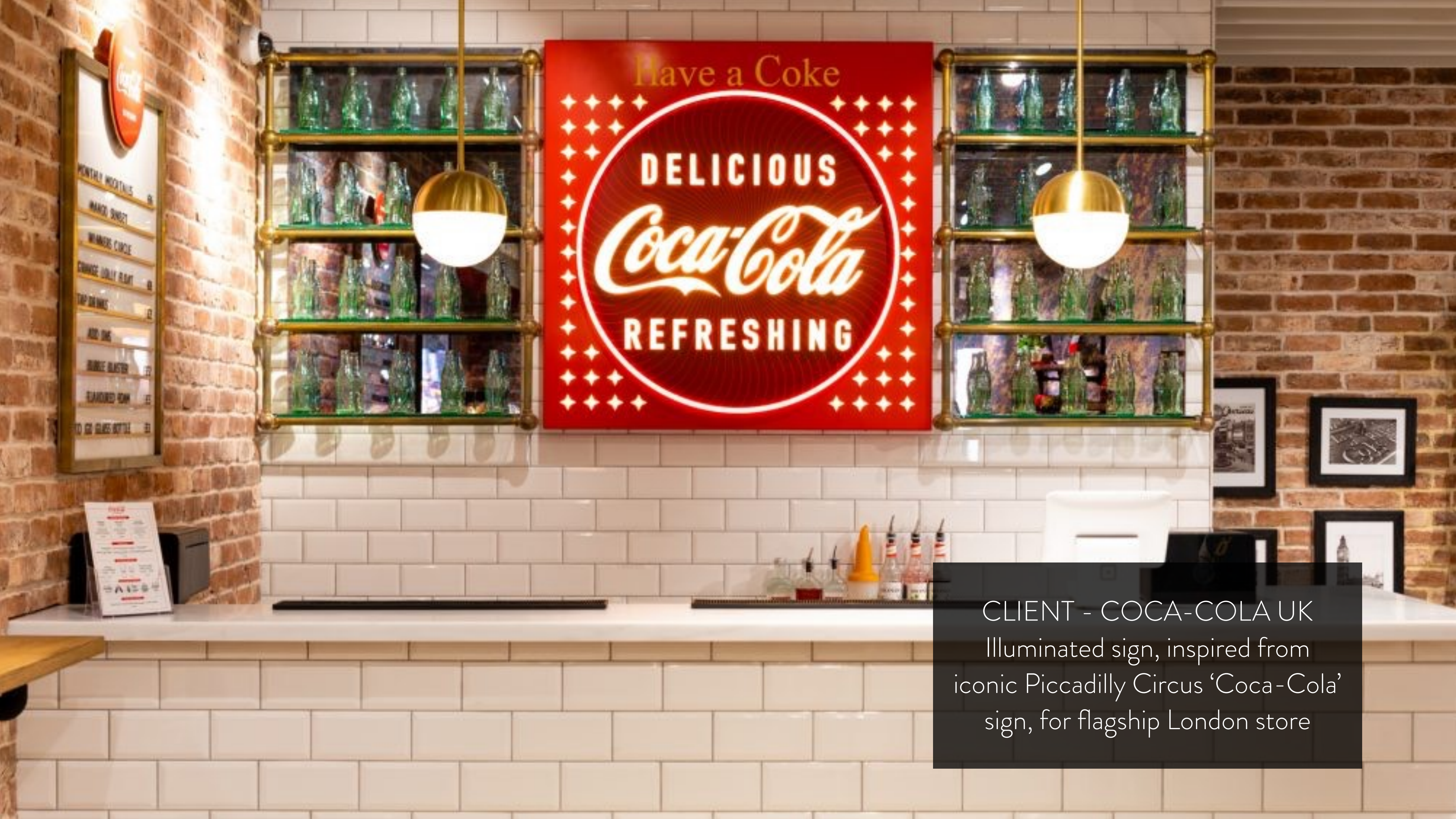
CLIENT - COCA-COLA UK Illuminated sign, inspired from iconic Piccadilly Circus 'Coca-Cola' sign, for flagship London store